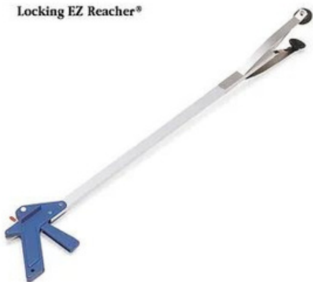
Locking EZ Reacher®